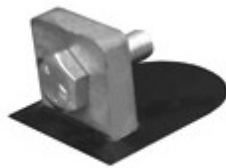
LT - Lug Terminal